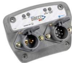
DF00096 Direct Max Cover Assembly