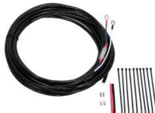
H-00521 Interior Light Power Harness Add-on, 25ft, for Plus, Flex, or Max