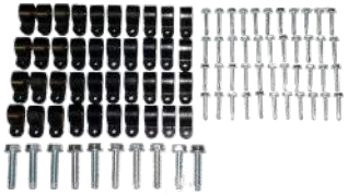
BK-1054 Hardware Bag Kit