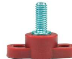
TM00021 Terminal, Red 3/8 Junction Stud