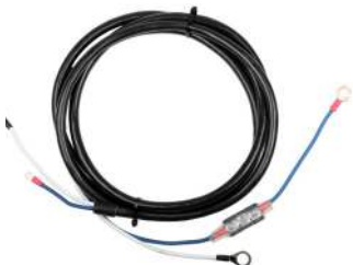
H-00289 Harness, Reefer for Select/Direct