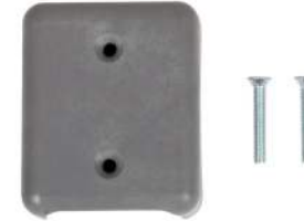
800-157 Fuse Cover Kit for Flex and Max Nosebox