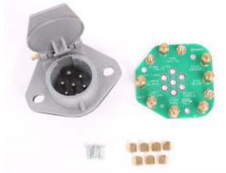
900-10 Nosebox, 7-way Receptacle and Support PCBA Replacement Kit for Dual Lid