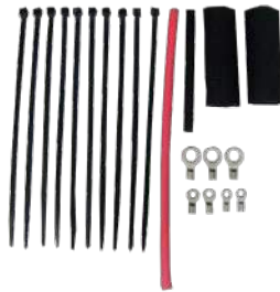
BK-1049 Terminal Bag Kit