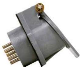
NB00041 Receptacle, Nylon 7-way with #10-32 Studs - Solid Pins