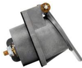
NB00048 Receptacle, Nylon Dual Pole