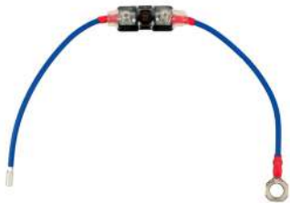
FH00043 Fuse Holder, 30 amp Midi Assembly