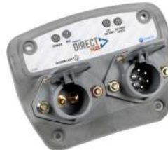
DF00095 Direct Flex Cover Assembly