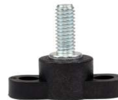
TM00020 Terminal, Black 3/8 Junction Stud