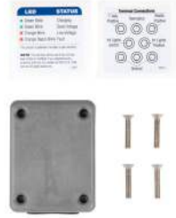
800-158 Cover Kit, REF/LGT Connect w/Gasket