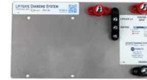
PL00066 Plate Assembly, Selector III Trail Charger Basic