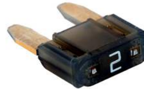
F00014 Fuse, 2 amp ATM Mini