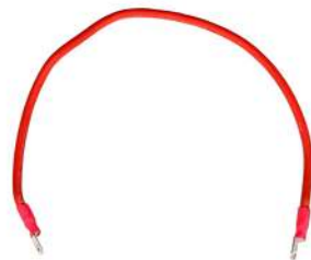
H-00054 Cable Assembly, 4 AWG Red Selector Switch to Liftgate Battery Positive