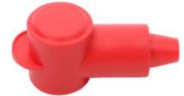
23517 Boot, Red Rubber