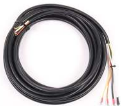
H-00508 Harness, 50 ft Main for Direct Plus, Max, Flex

Purkeys Direct™ Plus, Flex, Max Liftgate Charging Systems