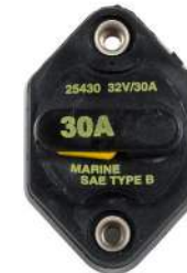
CB00024 Circuit Breaker, Mid-Range Manual Reset 30 Panel Mount