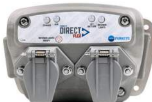
MOD00095-K Direct Flex Nosebox, Without Harness