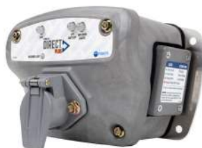
MOD00094-K Direct Plus Nosebox, Without Harness