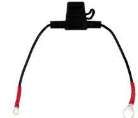
H-00282 Harness, Fused LG Positive Wire From Red Junction Stud to Terminal Strip