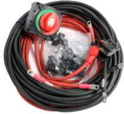
CA00138-SW Severe Service Trailer Link 23 ft, 4 AWG with Switch