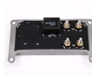
MOD00100 Module, Interior Light Controller for Direct Series