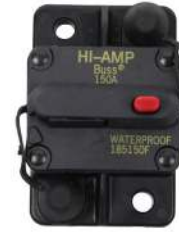
CB00002 Circuit Breaker, 150 AMP Surface Mount Type 3