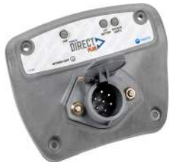
DF00094 Direct Plus Cover Assembly