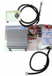
P1020-K Charging Plate Assembly for Direct or Select