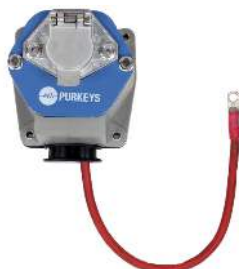
NB00052 Nosebox, Single Cavity Upgrade for Direct Flex Max