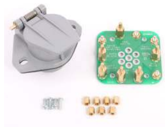
900-9 Nosebox, 7-way Receptacle and Support PCBA Replacement Kit for Single Lid