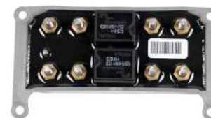
MOD00099 Module, Reefer/Interior Light Controller for Direct Series