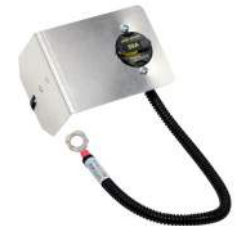
CB00025 Circuit Breaker Assembly, 30 amp Manual Reset and Bracket