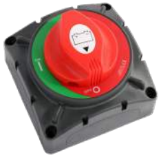
SW00034 Switch, On-Off

Purkeys Direct™ Plus, Flex, Max Liftgate Charging Systems