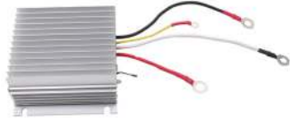
900-38 Converter, DC/DC 20 A

The following replacement parts are available.