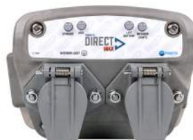
MOD00096-K Direct Max Nosebox, Without Harness