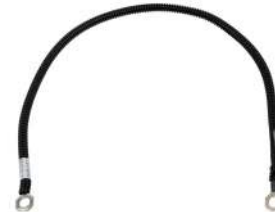
H-00263 Harness, 10 AWG White Ground Wire 2 Ft