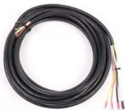
H-00516 Harness, 25 ft Main for Direct Plus, Flex, Max