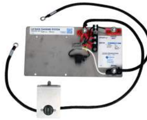
P1020-B Select/Direct Liftgate Charging System Upgrade Plate Assembly