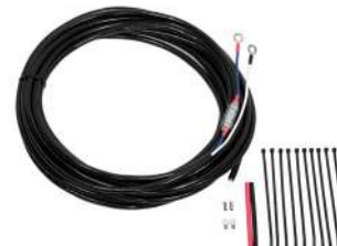
H-00522 Interior Light Power Harness Add-on, 50ft, for Plus, Flex, or Max