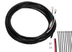
H-00523 Interior Light Power Harness Add-on, 70ft, for Plus, Flex, or Max