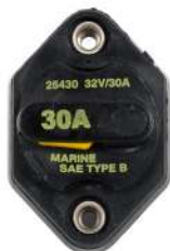
CB00024 Circuit Breaker, Mid-Range Manual Reset 30 Panel Mount