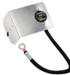
CB00025 Circuit Breaker Assembly, 30 amp Manual Reset and Bracket