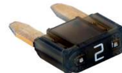
F00014 Fuse, 2 amp ATM Mini