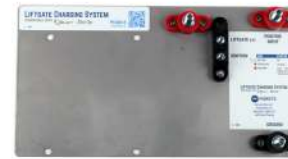
PL00066 Plate Assembly, Selector III Trail Charger Basic