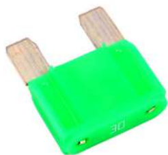
CB00010 Fuse, 30A 32V Maxi