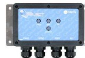
MOD00075 Select Controller Replacement