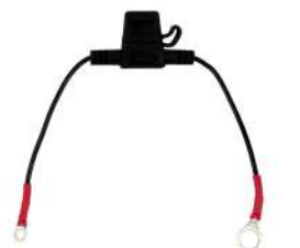
H-00282 Harness, Fused LG Positive Wire From Red Junction Stud to Terminal Strip