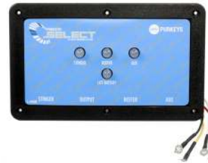
PL00082-R Select Front Panel Assembly