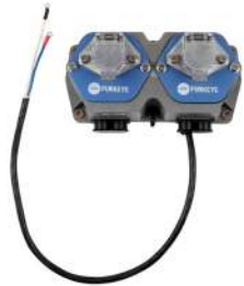
NB00036 Nosebox, Dual/Single Combination to Select/Direct

Purkeys Direct and Select Liftgate Charging Systems