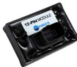
MOD00070 Select Programmed Module