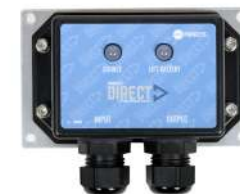
MOD00077 Controller, Direct W/ Mounting Bracket