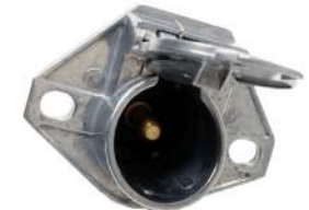
NB00001 Receptacle, Single Pole