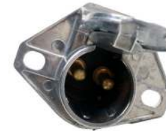
15-326 Receptacle, Dual Pole