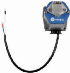
NB00037 Dual Pole to Select/Direct Nosebox Kit