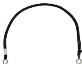
H-00263 Harness, 10 AWG White Ground Wire 2 Ft