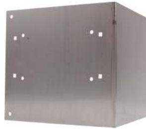
PL00079 Mounting Plate, Straight Truck Direct Controller