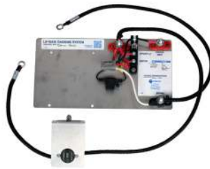
P1020-B Select/Direct Liftgate Charging System Upgrade Plate Assembly