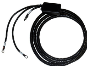
H-00494 Harness, Reefer to Select Including Module