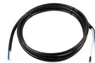
H-00288 Harness, 7-Way Circuit for Select/Direct