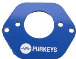
NB00005 Plate, Adapter Place with Purkeys Logo