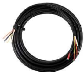
H-00315 Harness, 70 Ft 4 Conductor for Select or Direct