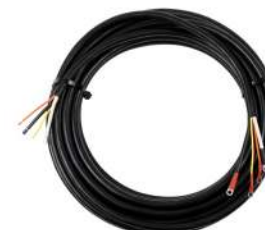
H-00286 Harness, 50 Ft 4 Conductor for Select or Direct