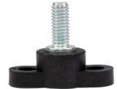
TM00020 Terminal, Black 3/8 Junction Stud