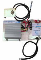
P1020-K Charging Plate Assembly for Direct or Select