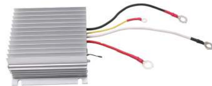
New Purkeys Part Number: 900-38

Please contact Purkeys' Technical Services Department if you have any questions. Phone: 479-419-4800 | www.purkeys.net/contact/