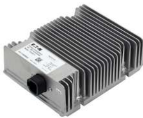
Current (old) Purkeys Part Number: 11020C00