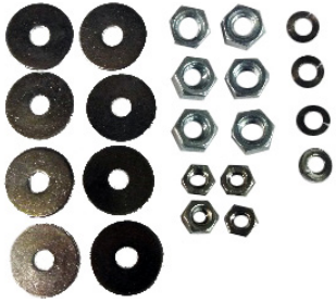
BK-1008 Hardware Kit For T/C Plate