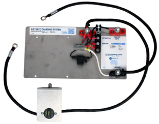
P1020-B Select/Direct Liftgate Charging System Upgrade Plate Assembly