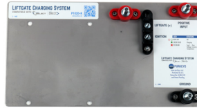
PL00066 Plate Assembly, Selector III Trail Charger Basic