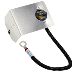
CB00025 30a Circuit Breaker & Bracket