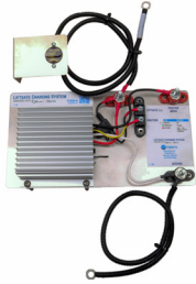
P1020-K Charging Plate Assembly for Direct or Select