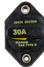
CB00024 Circuit Breaker, Mid-Range Manual Reset 30 Panel Mount